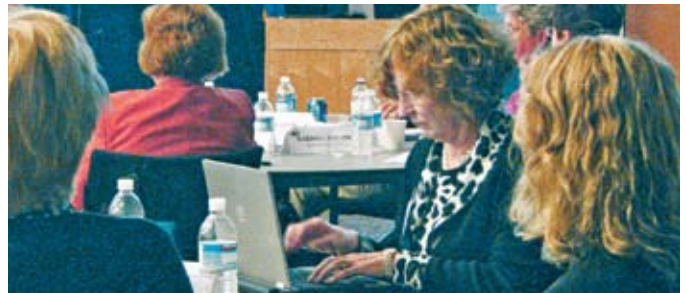
An engaged participant takes notes.