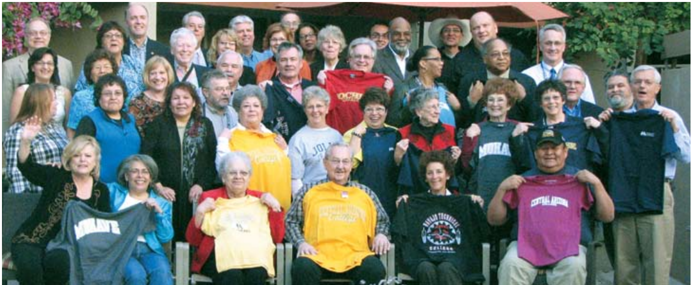
Trustees and presidents from Arizona, Illinois, Wyoming, Texas, California, American Samoa, Micronesia, Montana, Missouri, New Mexico, Michigan, South Dakota, Kansas, and North Dakota come together in Tempe.

MORE THAN 80 TRUSTEES AND PRESIDENTS FROM 29 COMMUNITY COLLEGES ACROSS 12 STATES, AS WELL AS American Samoa and Micronesia, convened at the Rio Salado Conference Center in Tempe, Ariz., for the 2010 Governance Leadership Institute to learn proven practices that strengthen the board/CEO relationship, help trustees accept responsibility for holding one another accountable, and provide tools and techniques to the officers of the board. Special thanks to the American Indian Higher Education Consortium (AIHEC) for encouraging trustees and presidents from tribal colleges to attend the 2010 GLI. In total, more than 20 individuals attended from tribal colleges and one township, adding a unique and exciting new dynamic to the GLI curriculum.