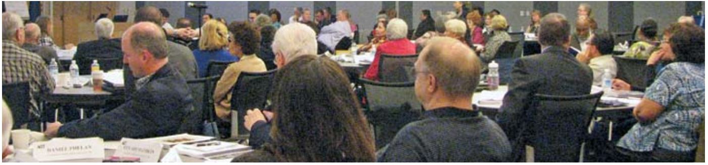
85 trustees and presidents listened to presentations and participated in workshops during the 2010 Governance Leadership Institute in Tempe, Ariz.