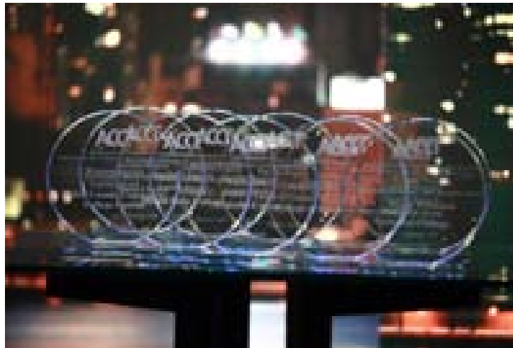
2008 Regional Awards