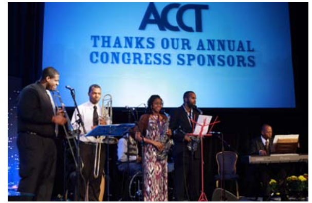
2008 Welcome Reception