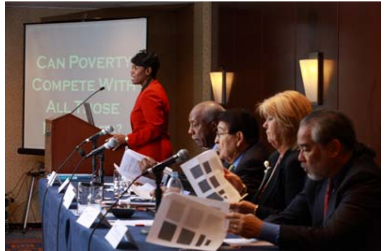
2008 Town Hall Meeting