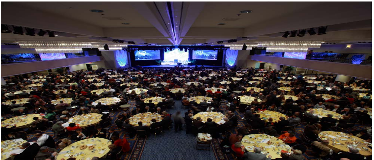
2008 New York Congress Opening Session Breakfast