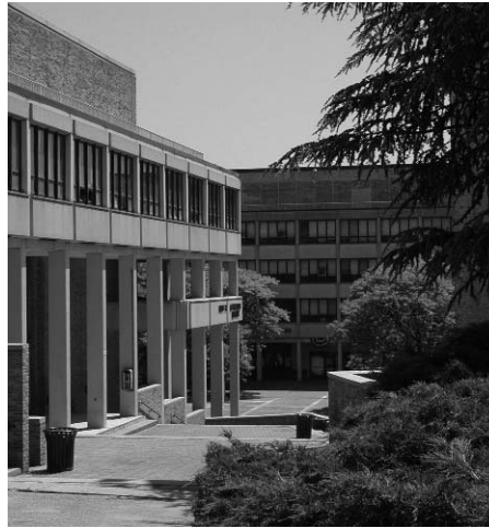
QUEENSBOROUGH COMMUNITY COLLEGE