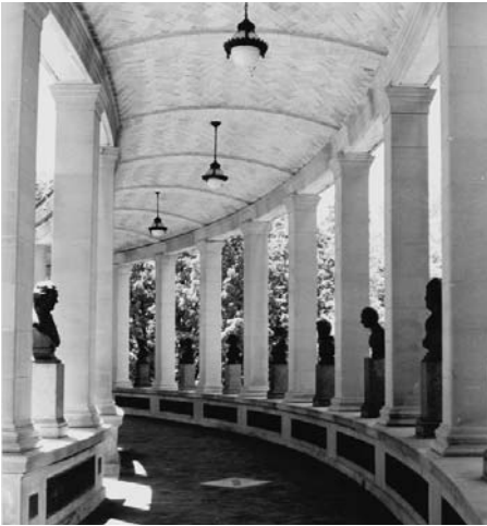
HOSTOS COMMUNITY COLLEGE