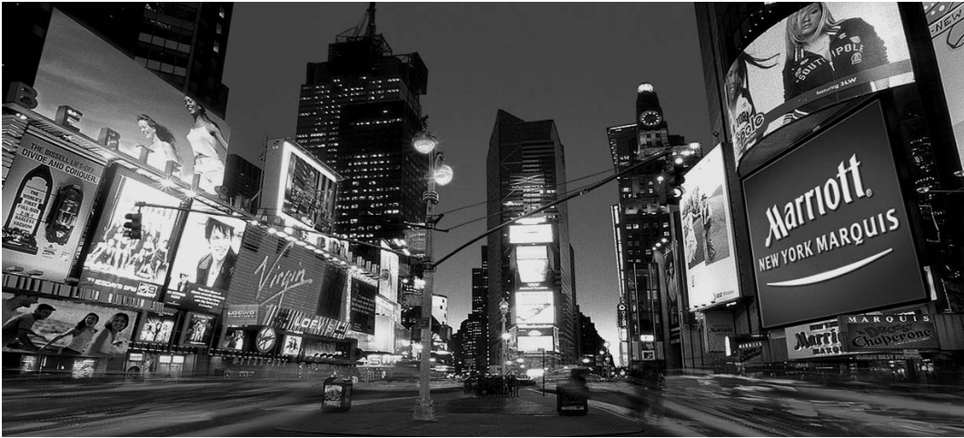
THE MARRIOTT MARQUIS HOTEL LOCATED IN TIME SQUARE