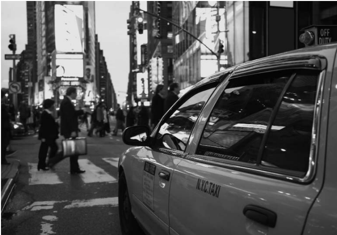
TAXI CAB IN TIME SQUARE