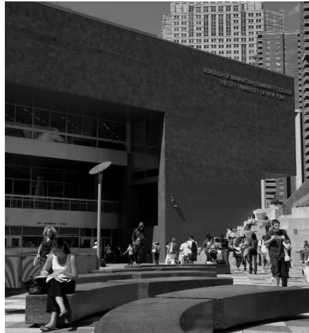
BOROUGH OF MANHATTAN COMMUNITY COLLEGE

Although there is no charge, advance sign up is required for these tours. Space is limited and participants will be accommodated on a first-come, first-served basis. If you are interested in participating, please sign up on the ACCT Congress registration form. Tours will depart from the 45th Street entrance of the New York Marriott Marquis.