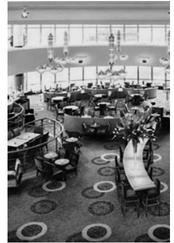
MARRIOTT'S BROADWAY LOUNGE