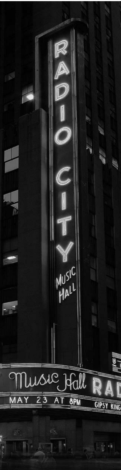
RADIO CITY MUSIC HALL