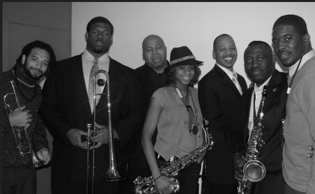
MEDGAR EVERS COMMUNITY COLLEGE JAZZ ENSEMBLE