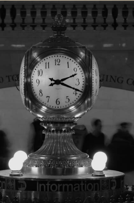
CLOCK IN GRAND CENTRAL STATION