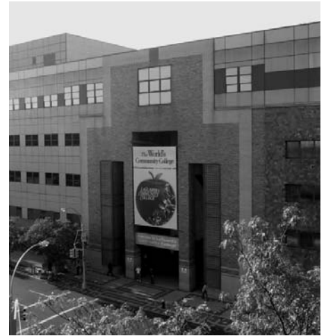
LAGUARDIA COMMUNITY COLLEGE